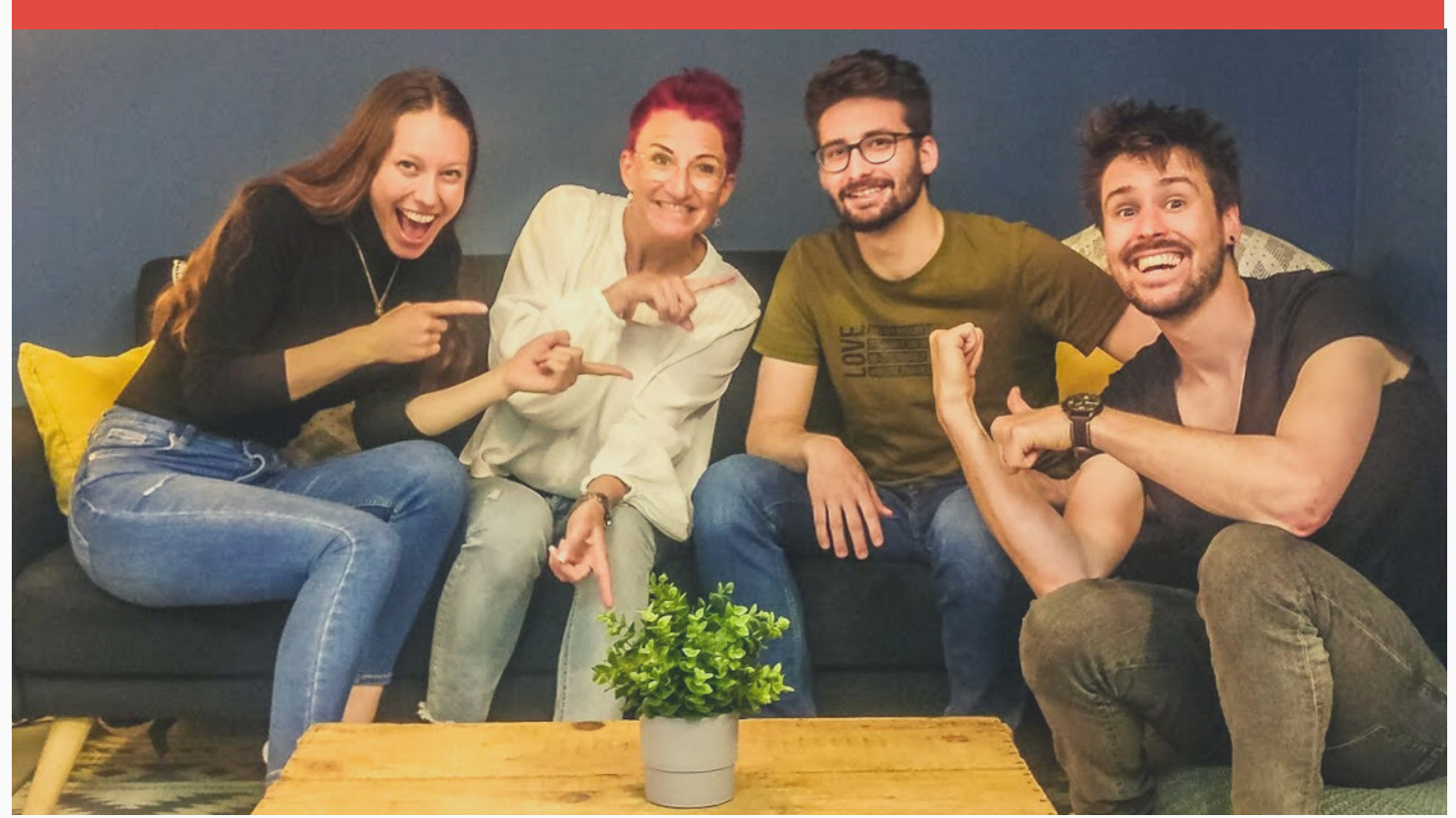
Alpha Switzerland Team