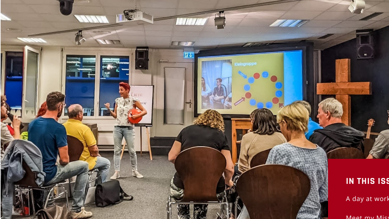
Alpha Basic Training in Zurich with 4 churches and their Alpha teams.